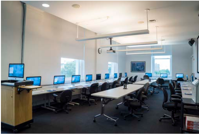
6 Labs | 18 Capacity