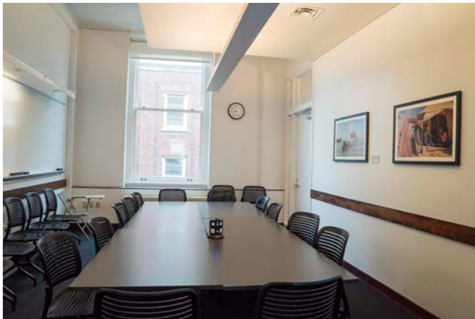
4 Seminar Rooms | 15 Capacity